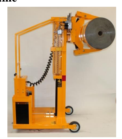
30 DAY TRIAL TOWARD PURCHASE PROGRAM AVAILABLE ON MOST MODELS