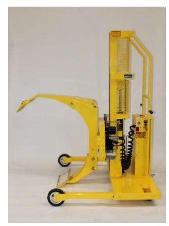
ER Counter Balanced Base Frame