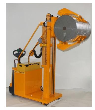
RCR 23/36 Clamp for 23" to 36" Diameter Rolls with 8" or 16" High Flexible Clamping Pads - Up to 900 lb. Capacity