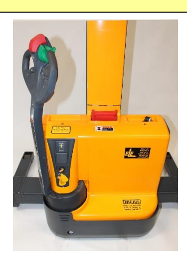
Easy Lift Equipment www.easylifteqpt.com