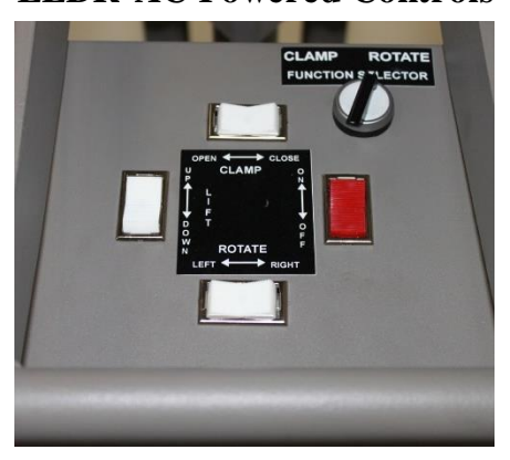
ELDR AC Powered Controls