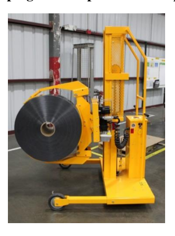
RCR 31/48 Clamp for 31" to 48" Diameter Rolls with 8" or 16" High Flexible Clamping Pads - Up to 600 lb. Capacity