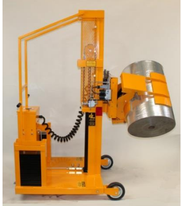
RCR 16/26 Clamp for 16" to 26" Diameter Rolls with 8" or 16" High Flexible Clamping Pads - Up to 1,200 lb. Capacity