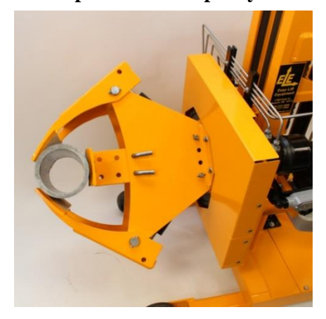
SRCR Clamp for 12" to 26" Diameter Rolls with 8" or 16" High Fixed Clamping Pads - Up to 500 lb. Capacity