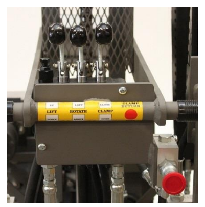
ELDR Air Powered Controls