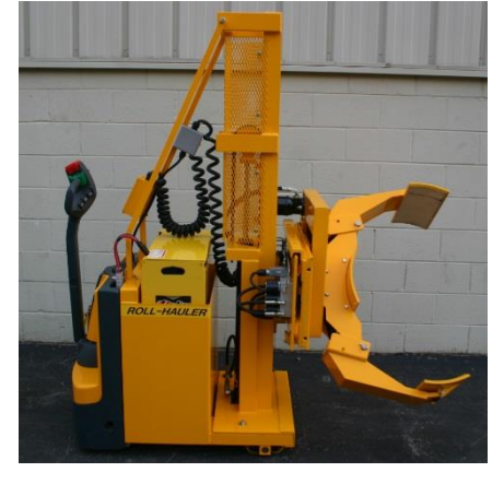
RCR 31/48 Clamp for 31" to 48" Diameter Rolls with 8" or 16" High Flexible Clamping Pads - Up to 600 lb. Capacity