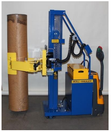
46.5 " Length