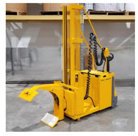
LRCR Clamp for 20" to 40" Diameter Rolls with 8" or 16" High Flexible Clamping Pads - Up to 700 lb. Capacity