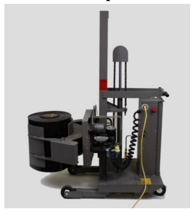
RCR 1324 Clamp for 13" to 24" Diameter Rolls with 8" or 16" High Fixed Clamping Pads - Up to 500 lb. Capacity