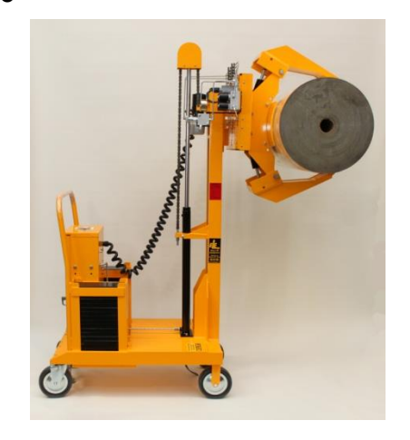
30 DAY TRIAL TOWARD PURCHASE PROGRAM AVAILABLE ON MOST MODELS