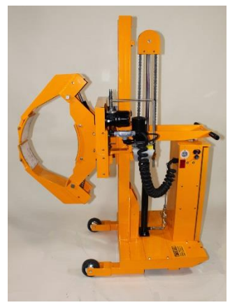
CCR Clamp for 5" to 13" Diameter Rolls with 8" or 16" High Fixed Clamping Pads - Up to 500 lb. Capacity