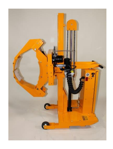
ELDR Counter Balanced Base Frame