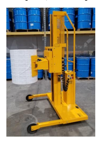
LRCR Clamp for 20" to 40" Diameter Rolls with 8" or 16" High Flexible Clamping Pads - Up to 700 lb. Capacity