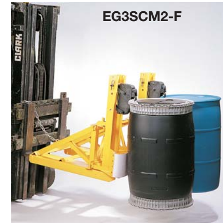
Fork pockets and safety chain provide quick installation to any lift truck.