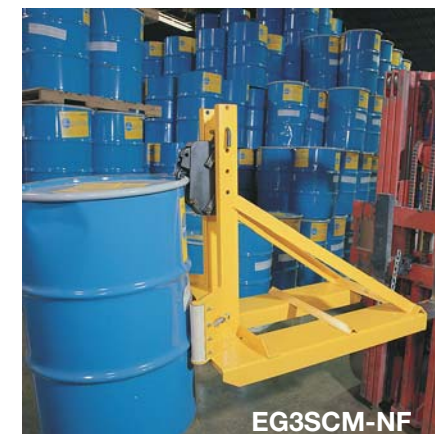
Narrow fork models remove tightly nested drums with ease.

The EG3 Series lift truck attachments utilize a heavy duty Eagle-Grip™ single automatic clamping mechanism for handling steel and plastic chimed drums in high volume applications.