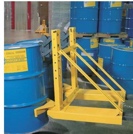
Handles 1 or 2 drums in low volume applications.