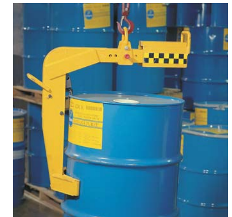
Model ETG1 can handle any chimed drum of all sizes. Adjustable counterweight keep drums of different weights and diameters perpendicular to floor when lifted. Used in conjunction with a hoist for palletizing drums off fill lines or placement in secondary containment pallets.

TRIAL PROGRAM AVAILABLE FOR ALL MODELS Call Today for Complete Details.