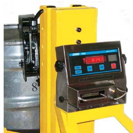
Doran Model 8000-IS Indicator for use in intrinsically safe areas