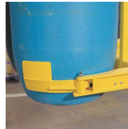
Mechanical clamping arms hold tapered drums tightly for transport.