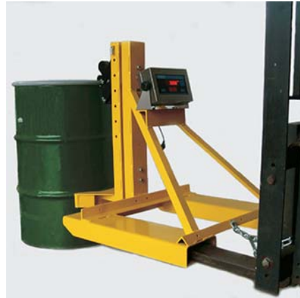
Model EG1SCM-F-S extremely accurate and economical

Drastically reduces the time required to inventory weights of partial drums manually.