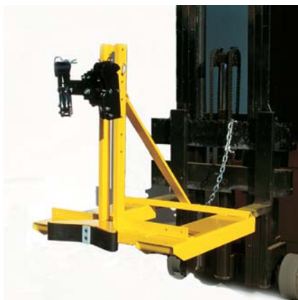
EG2LDCM-F with standard beltbase.