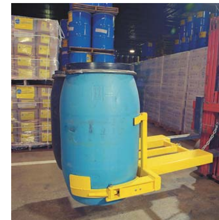
Drums rest against circular backrest for correct vertical support.

European style plastic drums have steadily increased in numbers worldwide, especially among exporters of fruit juices and other food products. Having no lifting chime, they are typically manhandled from double stacked overseas containers. The model EPG2-F can handle 1 or 2 drums at a time through the use of clamping arms which wrap around the tapered sides of the drum.