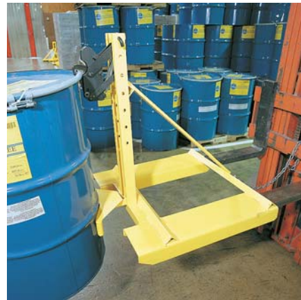
EG1SCM - F Single Drum Attachment Handles all chimed steel or plastic drums.