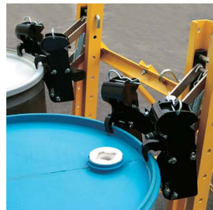
EG2 Series swiveling heads work on most different drum chime configurations.

The EG2 Series lift truck attachments utilize a light duty Eagle-Grip™ double articulating clamping mechanism for handling any size steel, fibre or plastic chimed drum. The model EG2DCM-CM attaches to all Class II lift truck carriages. Other EG2 models are provided with totally enclosed fork pockets and a safety chain to attach to the lift truck carriage. All Eagle-Grip™ clamping mechanisms are completely automatic requiring no electrical or hydraulic connections. The articulating or swivel feature of the heads permits simple pickup of drums that are misaligned and slightly separated. Standard belt bases support the lower side of the drum eliminating dents or cosmetic marring. Optional non-sparking jaws are available for handling flammables.