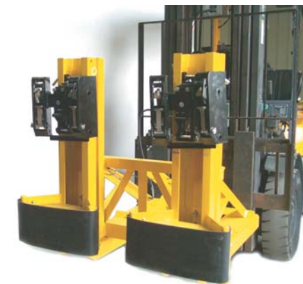
Model EG4DCM2-F-S for high volume drum weighing

All Eagle-Grip™ attachments can be equipped with custom load cells and indicators to provide a self contained means of weighing single drums using a lift truck or stacker. There are no external connections to the lift truck besides the OSHA safety chain.