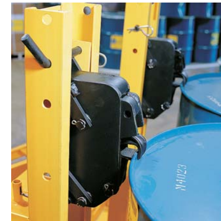
Quick vertical head adjustments permit handling of shorter height drums.