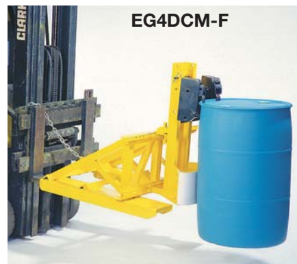
Single drum unit can be converted to a double drum attachment at a later date.