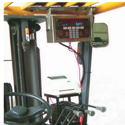
Indicator & Label Printer conveniently mounted