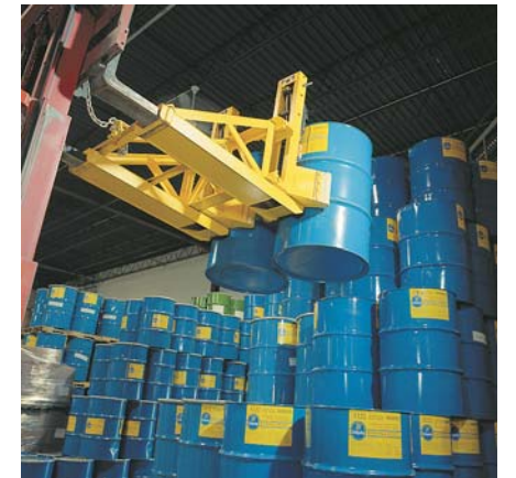
Step tiering drums without pallets saves valuable warehouse space.

Optional non-sparking jaws are available for handling flammables.