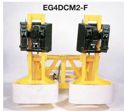
Protective belt cradles eliminate cosmetic marring on any drum surface.