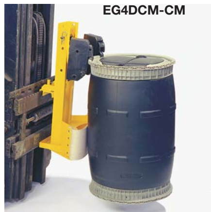
Carriage mounted models fit any Class II carriage for handling drums in congested areas.

Choose The Confidence That Comes With Quality American Craftsmanship!