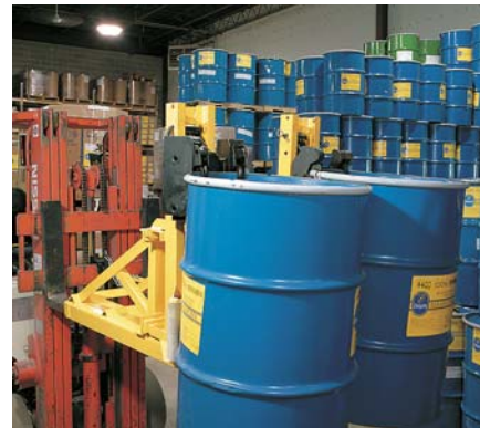
Double gripping jaws are ideal for light gauge open-head steel drums in high volume applications