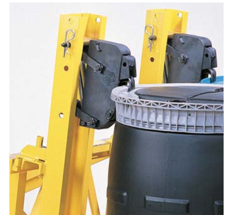
Heavy duty positive clamping jaws provide safe high volume handling of steel and plastic drums.