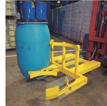
Handles 1 or 2 drums at a time.