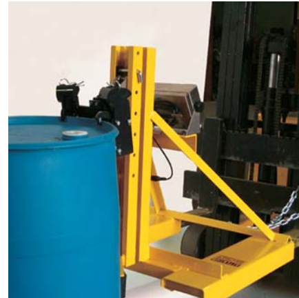
Model EG2LDCM-F-S with double clamping head

Eagle-Grip™ attachments are also available to weigh up to two drums at a time. These models require the indicator to be mounted to the overhead guard of the lift truck. Weights for each drum can be stored and downloaded to a computer through the indicator. An optional label printer provides a means of tracking product, printing company information, weights and more.