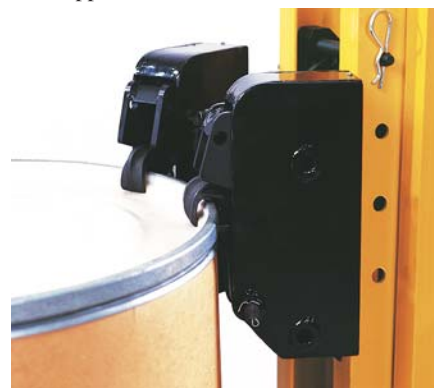
Double clamping mechanism disperses the load on the chime of any fibre drum.