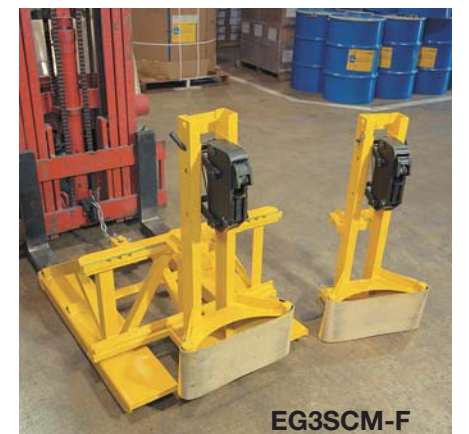
Single drum attachment can be converted to a double drum unit by adding another EG3SCM-CM unit.