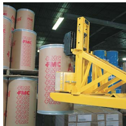
Order picking saves time by eliminating the need to manually handle one drum from a full pallet.