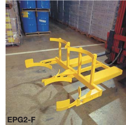
EPG2-F Completely mechanical attachment slides on/off forks in seconds.