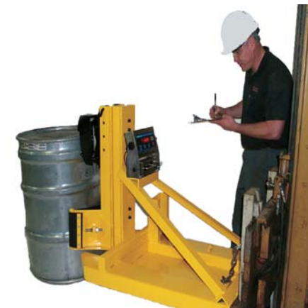
Model EG4DCM-NF-IS handles drums to 2000 lb.